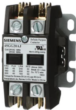
Contactor, 45DP,40A,2P,Open,277 Contactor, 45DP,40A,2P,Open,277