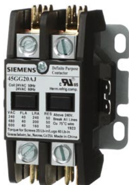
Contactor, 45DP,40A,2P,Open,24V Contactor, 45DP,40A,2P,Open,24V