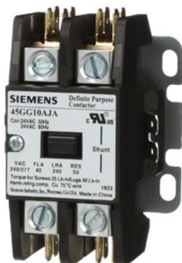
Contactor, 45DP,40A,1P,Open,480 Contactor, 45DP,40A,1P,Open,480