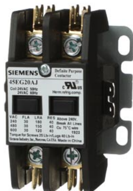
Contactor, 45DP,30A,2P,Open,277 Contactor, 45DP,30A,2P,Open,277