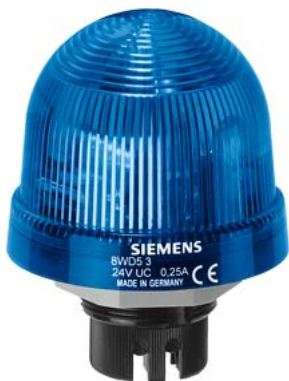
Integrated signal lamp, rotating light, with integrated LED, blue, 24 V AC/DC, Diameter 70 mm