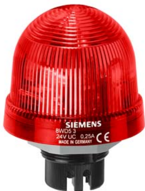
Integrated signal lamp, repeated flash light, with integrated LED, red, 24 V AC/DC, Diameter 70 mm