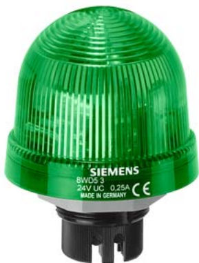
Integrated signal lamp, continuous light, green, 12-230 V AC/DC, Diameter 70 mm