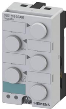
SIMATIC NET, Repeater for AS-Interface for cable extension in K45 enclosure