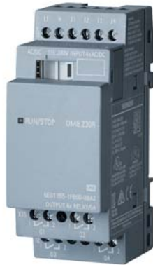
LOGO! DM8 230R expansion module, PS/I/O: 230V/230V/relay, 2 MW, 4 DI/4 DO for LOGO! 8