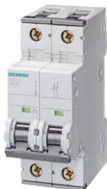
Miniature circuit breaker 230 V 10kA, 1+N-pole, D, 6 A, D=70 mm