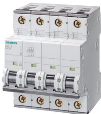
Miniature circuit breaker 400 V 10kA, 4-pole, C, 20 A, D=70 mm