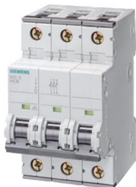
Miniature circuit breaker 400 V 10kA, 3-pole, C, 10A, D=70 mm