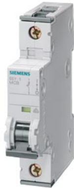
Miniature circuit breaker 230/400 V 10kA, 1-pole, A, 1.6 A, D=70 mm