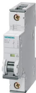
Miniature circuit breaker 230/400 V 10kA, 1-pole, A, 0.5 A, D=70 mm