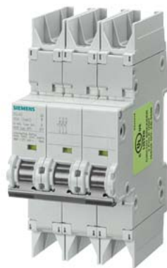
Circuit breaker 10kA, 3-pole, D, 30 A according to UL 489-480Y/277V