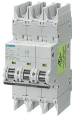
Circuit breaker 10kA, 3-pole, C, 30 A according to UL 489-480Y/277V