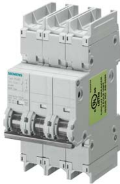
Miniature circuit breaker 240 V 14kA, 3-pole, D, 15 A, D=70 mm according to UL 489