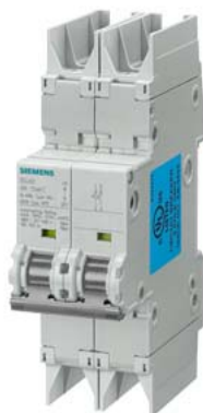
Circuit breaker 10kA, 2-pole, C, 30 A according to UL 489-480Y/277V