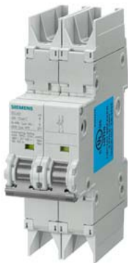
Circuit breaker 10kA, 2-pole, C, 20A according to UL 489-480Y/277V