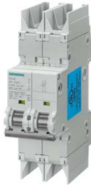
Circuit breaker 10kA, 2-pole, D, 4 A according to UL 489-480Y/277V