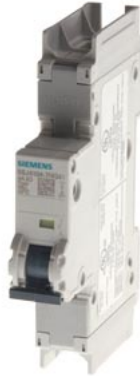
Miniature circuit breaker 240 V 14kA, 1-pole, C, 20 A, D=70 mm according to UL 489