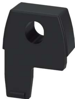
Push-in lugs for wall mounting of SIRIUS devices in industrial standard mounting rail enclosure