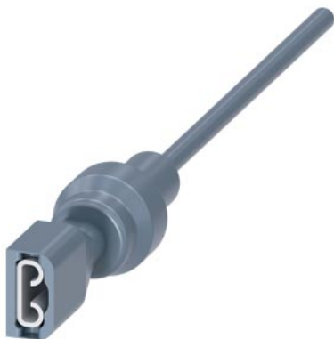
voltage tap accessory for: ETU 8-series