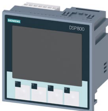
DSP800 display accessory for: 1 to 8 3VA breakers