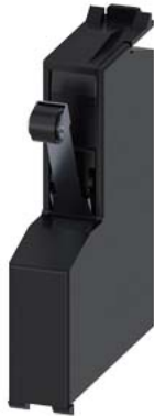
position signaling switch accessory for: plug-in and draw-out unit