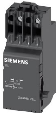
shunt trip left 12V DC accessory for: 3VA4/5/6