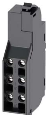
auxiliary switch changeover contacts type HP (14mm) accessory for: 3VA4/5/6