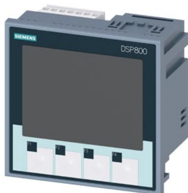
DSP800 display accessory for: 1 to 8 3VA breakers