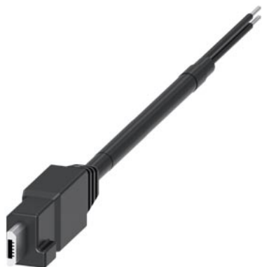
connecting cable for N-CT-3VA accessory for: external current transformer