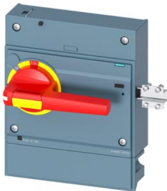
FRONT MOUNTED ROTARY OPERATOR EMERGENCY-OFF WITH DOOR INTERLOCKING IEC IP30/40 ACCESSORY FOR 3VA15/25 1000