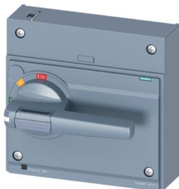
FRONT MOUNTED ROTARY OPERATOR STANDARD IEC IP30/40 ACCESSORY FOR 3VA15/25 1000