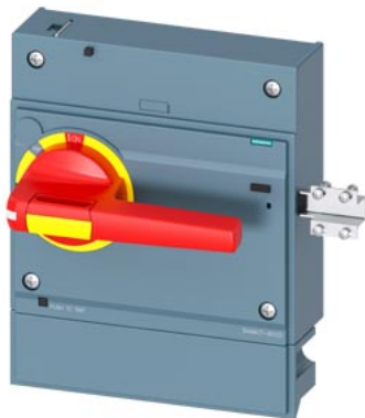
Front mounted rotary operator EMERGENCY-OFF with door interlocking IEC IP30/40 accessory for: 3VA55/3VA65/3VA66