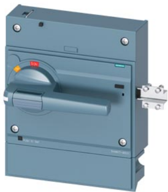
Front mounted rotary operator standard with door interlocking IEC IP30/40 accessory for: 3VA55/3VA65/3VA66