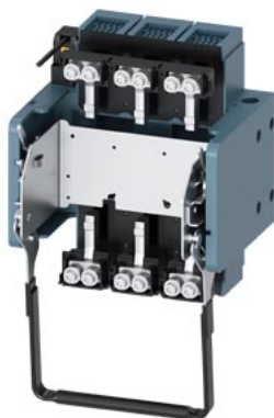
Plug-in insert complete kit accessories for: Circuit breaker, 3-pole 3VA15, 3VA25