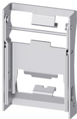
Handle blocking device ACCESSORY FOR: 3VA15/25 1000