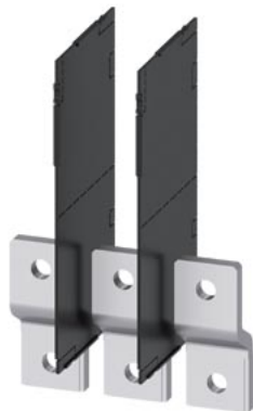
bus connector extended front 3 units accessory for: 3VA1 400/630 3VA2 400/630