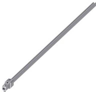
shaft for pistol grip rotary handle operator 24" (600mm) accessory for: 3VA51/52/53/54 125A ... 600A 3VA61/62/63/64 150A ... 600A