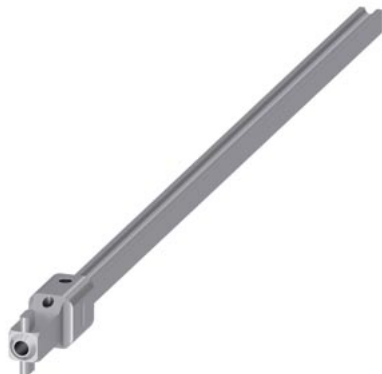
rotary handle operator 12" (300mm) accessory for: 3VA51/52/53/54 125A ... 600A 3VA61/62/63/64 150A ... 600A