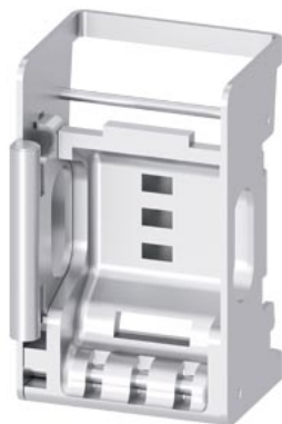
padlock device for handle accessory for: 3VA1 400/630 3VA2 100/160/250/400/630