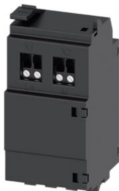
24 V module accessory for: 3VA2 400/630/1000