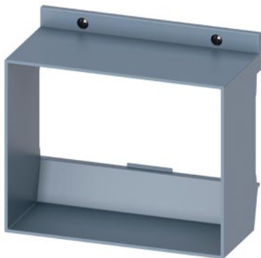
door feedthrough accessory for: circuit breaker, 3/4-pole 3VA6 400/600