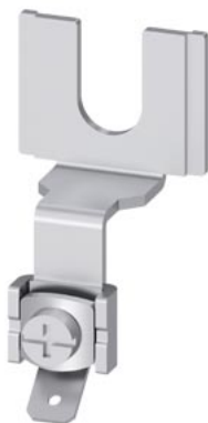
CONTROL WIRE TAP FOR BUSBAR ACCESSORY FOR: 3VA2 100/160/250 3VA1 250 PLUG-IN / DRAW-OUT