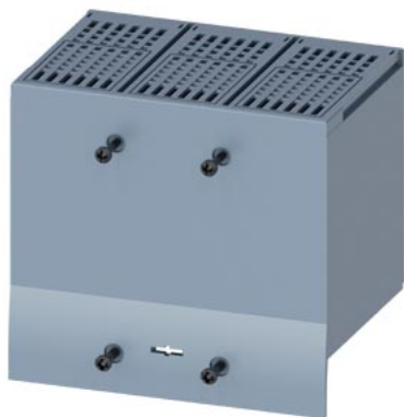
terminal cover extended 3-pole 1 unit accessory for: 3VA6 150/250 3VA5 250 plug-in/draw-out socket 3VA6 150/250