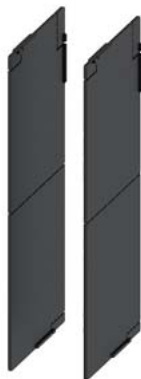
phase barriers 2 units accessory for: 3VA2 100/160/250