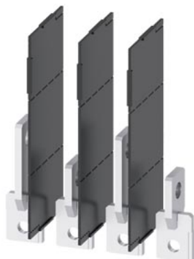
bus connector extended edgewise 4 units accessory for: 3VA1 250