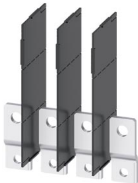
bus connector extended front 4 units accessory for: 3VA1 250