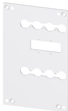
rear interlock mounting plate accessory for: 3VA5 250