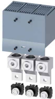
Wire connector TA2.2 2 AWG...350 kcmil large 3 units accessories for: 3VA5 250