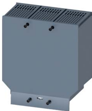
terminal cover offset 3-pole 1 unit accessory for: 3VA2 100/160/250