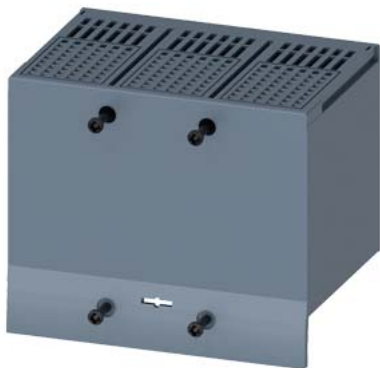
terminal cover extended 3-pole 1 unit accessory for: 3VA2 100/160/250